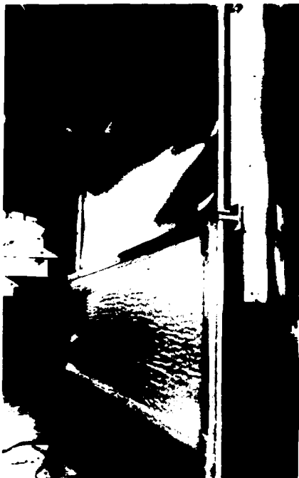
Fig. 2: Window Assembly

Note that it is possible for the accelerator to share common vacuum with this tank. A fast valve is installed for accelerator protection.