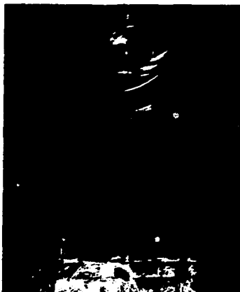
Opening session of 47th General Assembly with GA President, Stoyan Ganev and Secretary-General Boutros Boutros-Ghali to his right and Under-Secretary-General Vladimir Petrovsky

India also held that mechanisms should be set up to go into operation immediately and automatically as soon as sanctions were imposed which caused special economic problems to States imposing sanctions. This would encourage States to cooperate with Council decisions.