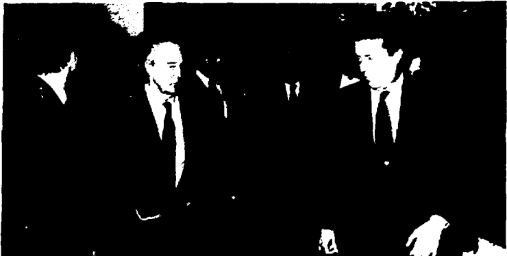
French Foreign Minister Roland Dumas and German Foreign Minister Klaus Kinkel accompany the Secretary-General into the UNESCO building with its Director-General, Federico Mayor, for the Paris Signing Ceremony of the Chemical Weapons Convention, 13-15 January 1993.

With respect to old chemical weapons and abandoned chemical weapons, each State party is to declare whether it has any on its territory or on the territory of other States and is to provide information on them.