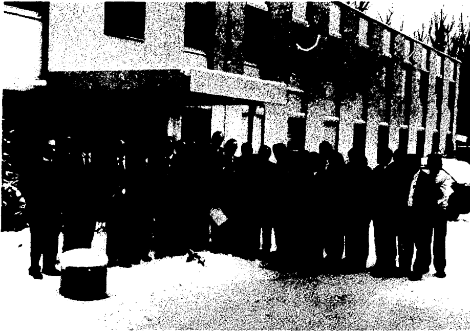
Participants of the Technical Meeting on Experimental Approach to the Physics of the High Density Divertor

experiments, edge models and simulators. The interaction of all three elements and the resulting model validation will allow an extrapolation to ITER parameters and in the end will give confidence in the divertor concept.