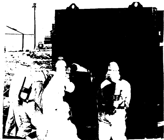
Figure 3. ISTV Wall Panel Testing