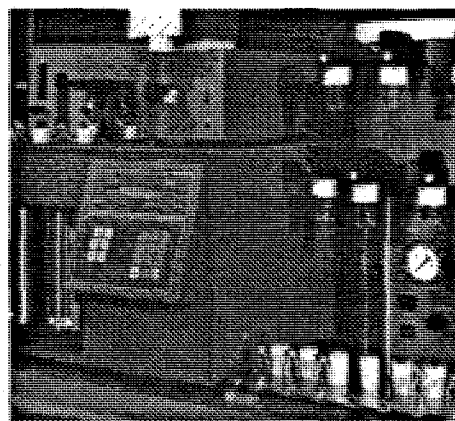
The Standard Laboratory Module is the fundamental building block of the CAA system. Users can use each module independently, combine Modules into Mini-SAMs that perform independent functions, or combine Modules into complete, EPA-approved Standard Analysis Methods.

High-speed automated laboratories located at potential cleanup sites will reduce sample turnaround from the traditional range of 90-120 days to a conservative 12-18 days, with many samples analyzed and data prepared in 1-5 days. Faster turnaround time will allow faster site cleanup and more efficient use of environmental engineering resources.