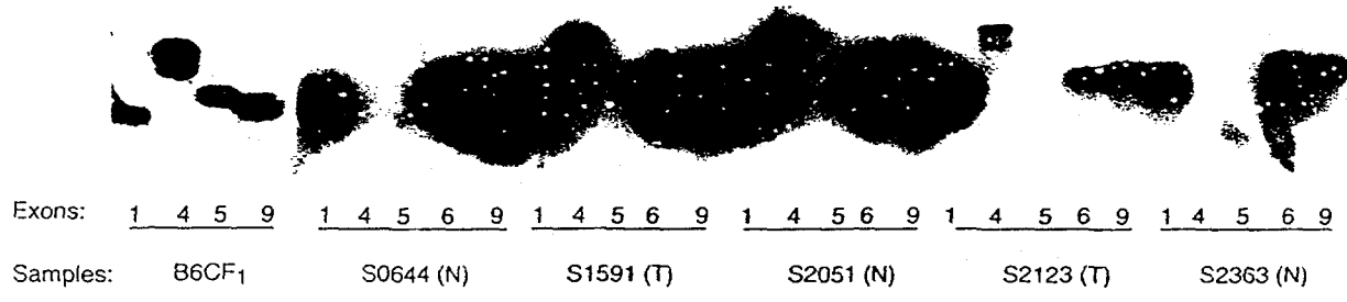
Figure 3. Zhang and Woloschak