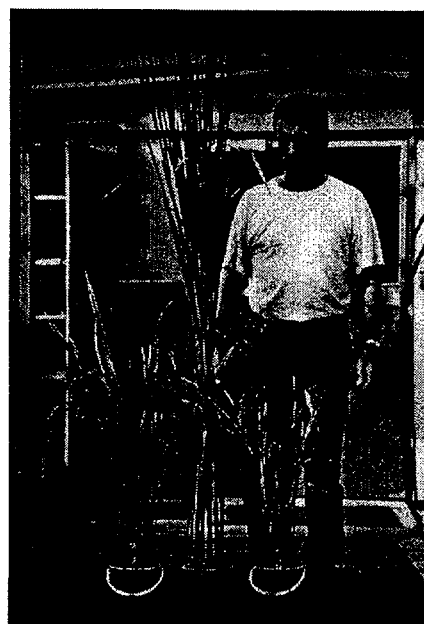
Fig. 2: Gametoclonal variants of Pokkali

RAPD analysis was performed in 18 DH2 gametoclonal lines, in 3 normal doubled-haploid plants from Pokkali and in a seed derived plant from Nona Bokra and Pokkali.