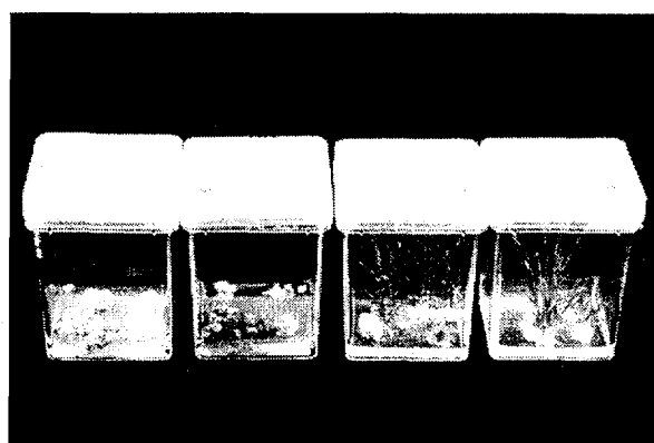
Fig. 1 Androgenesis in the variety Dz-Cr-37. Seeds from donor plants irradiated with 400 Gy.

We studied the effect of radiation on callus induction and green plant regeneration using different in vitro culture techniques. Seeds, anthers, spikelets, and young leaves were used as explants. Different induction and regeneration media were evaluated to establish the best culture conditions.