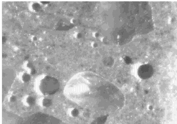
Figure 2. Original image of concrete surface.