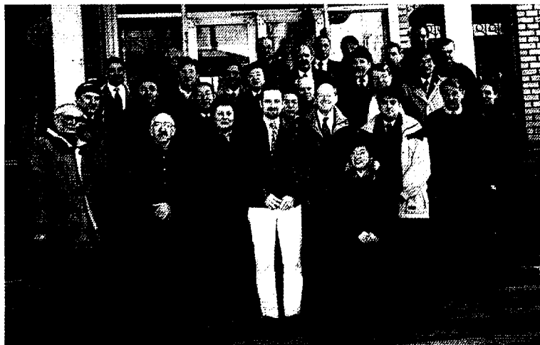
Participants in the Meeting