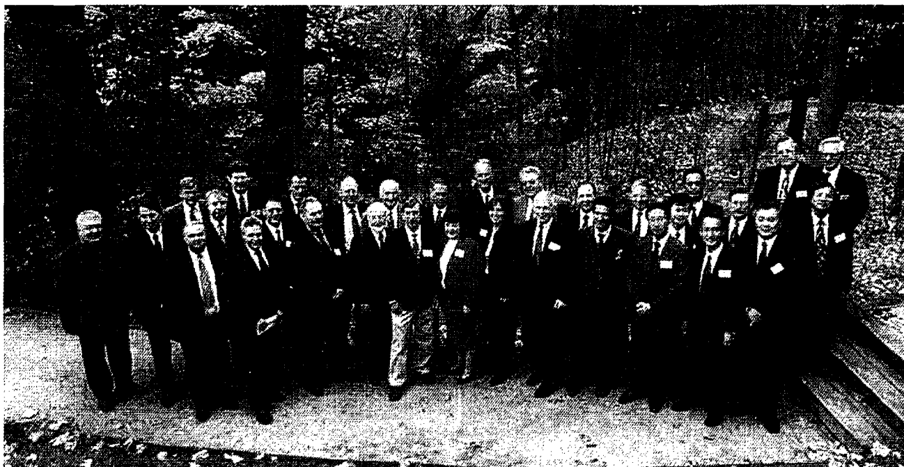
Participants in the Meeting

The ITER project has made significant progress since the Tokyo meeting. The ITER Joint Central Team has developed a reduced cost design for ITER that meets the overall programmatic objective to provide all the necessary answers to technical issues and allow a demonstration fusion power plant to be built. During 2000, non-committal Explorations between the Parties have been carried out to prepare for Negotiations towards the realization of the joint implementation of ITER among interested parties. Canada, Europe and Japan each are known to be interested in the possibility of hosting ITER. The Joint Central Team has issued procurement documents for the main ITER systems to the Parties to enable the industrial costing of the reduced cost ITER, and to help the Parties to consider their possible contributions. This excellent progress on ITER design and decision making prompted industrialists of the Parties to convene the 3 rd IILM.