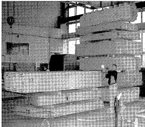
Figure 2 This Health Physics worker carries out the last measurement before the free release of the concrete antimissile slabs, to ensure an independent measure.