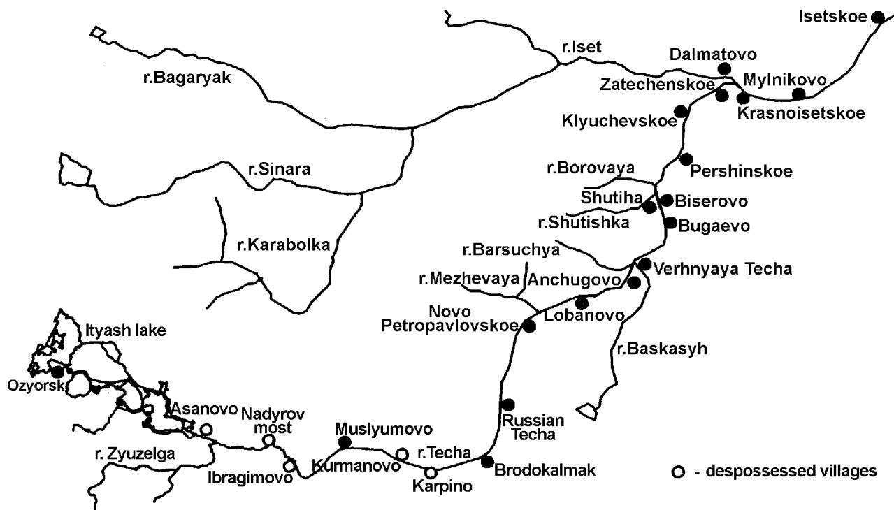
FIGURE 1. The hydrological system of Techa river

The Techa river rises from the Irtyash lake and empties into the Iset river the joins the Tobol river. (Figure 1).