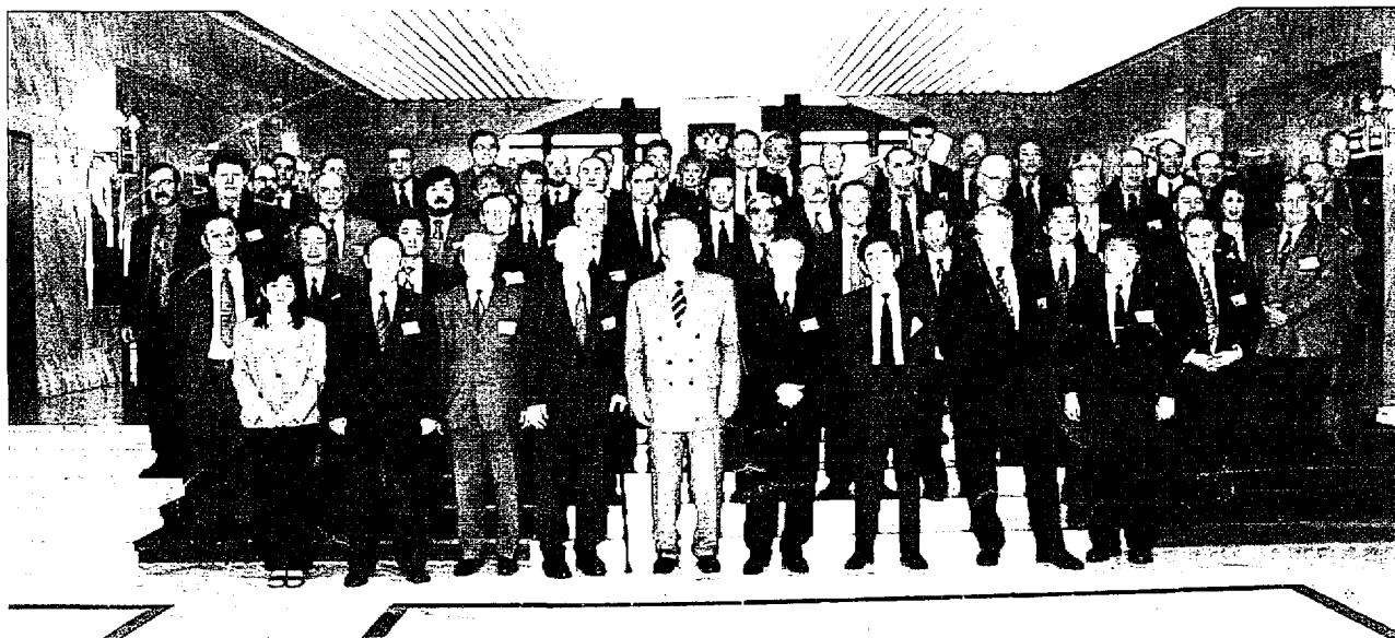
Participants in the Meeting

The JA delegation reported on the present status of discussion by the Council of Science and Technology Policy (CSTP) on JA participation in ITER, including possible hosting. The conclusion of the CSTP was expected in the near future. It was stressed that JA has a strong interest in participation/hosting of ITER and that the discussion was approaching the final stage. The JA delegation also reported that the basic principles of the safety management of ITER and safety regulations were being discussed by Ministry of Education, Culture, Sports, Science and Technology (MEXT) and the Nuclear Safety Commission.