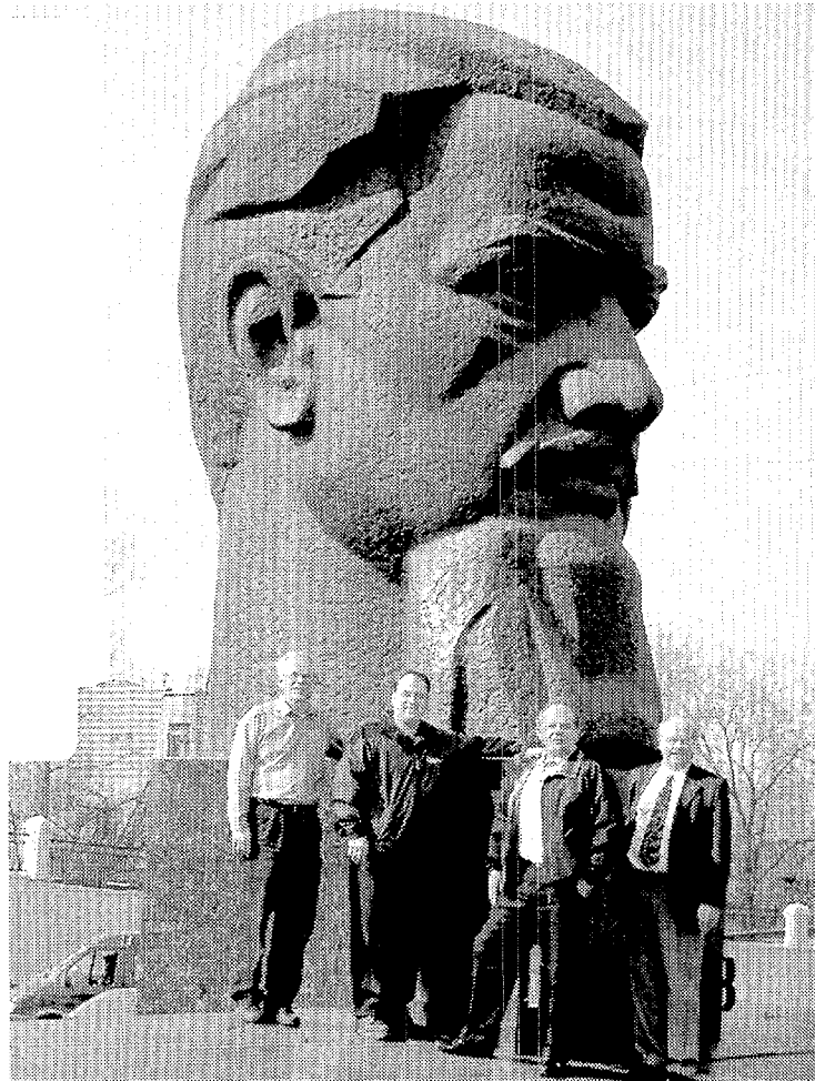
Canadian guests in front of the sculpture of Kurchatov at the entrance to the KI