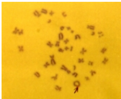
Picture 8. Microphotography of "ring" chromosome out of 13 th pair, Gizma stained, 1000 times.

Available information from literature and those attained through experiments, lead to a conclusion that harmful abiotic and biotic factors in water, air and food damage DNA structure in molecule and thus influence genome on the whole.