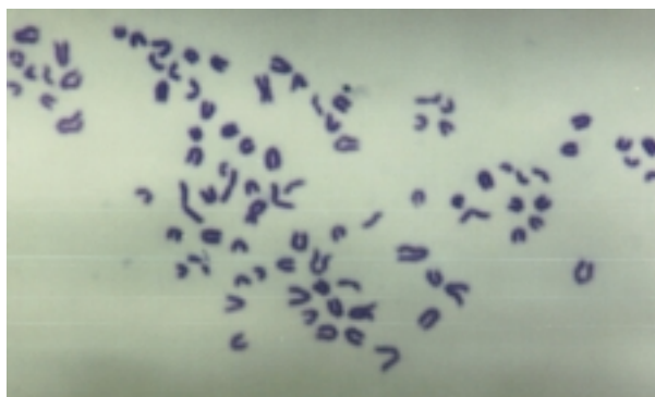
Picture 3. Microphotography of karyotype with aneuplidia 2n>60 , 2n=89 XX, Gizma stained, 1000 times

In the chosen group of cows, three cows with numerical and structural changes on chromosomes were discovered. Numerical changes were aneuploidia 2n>60 and in cow karyotype Tet. No. 38241 two kind of cells were discovered with 11% higher number of chromosome ( 2n>60 , 2n=89 XX) and 23% cells with 2n>60 , 2n=73 XX (Pictures 3, 4).