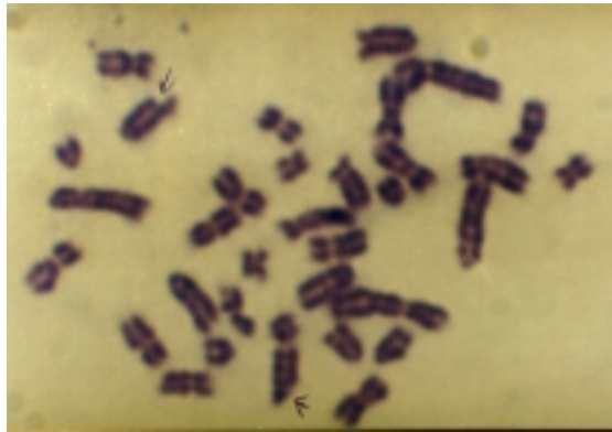
Picture 7. Microphotography of rcp. (14q+; 2q-) Gizma stained, 1000 times

Since this mutagen change is balanced, genetic material was not lost, no functional changes were discovered, but there were evident disturbances in reproduction and in mortality of embryos. In the literature from our country and abroad reciprocal translocation is considered a serious cause of disturbances in swine reproduction [2]. Discovered "ring" change on chromosome was on one homologous 13 pair and indicates presence of intensive radiation on this area during bombing. This chromosome aberration appeared "de novo" and was discovered in 26% of the examined metaphases.