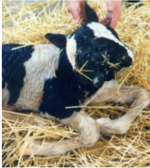
Picture 6. Photography of calves with two heads. Calved in 2000