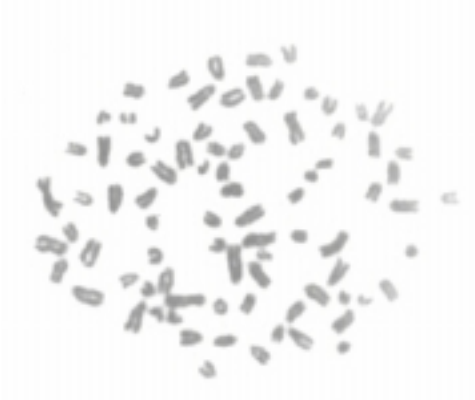
Picture 4. Microphotography of karyotype with aneuploidia 2n > 60 , 2n = 73XX , Gizmo stained, 1000 times

metaphases 49% cells had already mentioned structural change. Reproduction disturbances were present in these cases and miscarriage occurred in the first part of gravity.