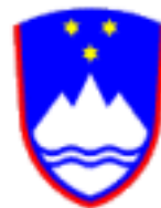
Slovenian Nuclear Safety Administration