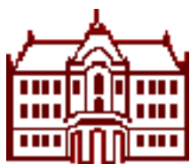
University of Ljubljana Graduate Program Nuclear Engineering