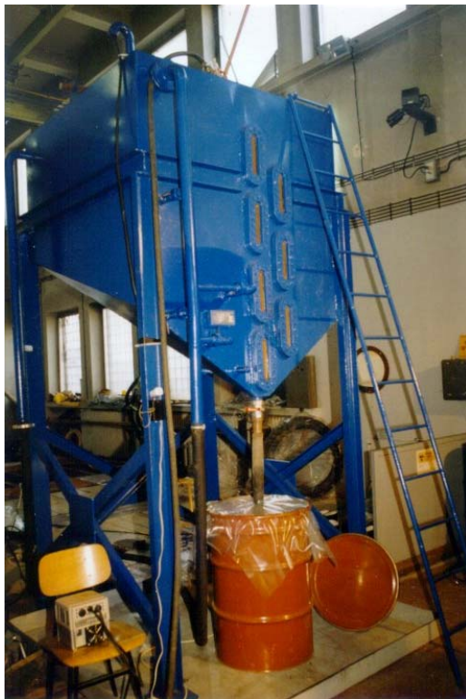
Fig 1 Sludge sedimentation vessel and the cask

The existing pilot cement mixer was reconstructed to enable simple placing a barrel containing the sludge on its platform without a risk of spilling. Rooms for conditioning the sludge in a cement matrix, supplied with independent ventilation system, and for storing the casks during the period needed for cement hardening, have been arranged. When the cask with settled sludge is placed on the platform of the mixer, an amount of about 90 kg of cement (PC-45 MPa) was added into the cask. Mechanical manipulator (Figure 2) was used to mix this mixture until a homogeneous substance ('matrix') was obtained [8]. This technology for sludge conditioning eliminates all the risks related to pouring the sludge into the concrete mixer and pouring the cement-sludge mixture into the metal barrel. The barrel with the homogenised mixture is removed from the mixer platform and placed in a separate room to harden mixture for about 2 days. In final stage of conditioning of sludge immobilised in a cement matrix, the cask is covered with the concrete cork. When concrete cork is hardened, the cask is covered by a metal lid that is fixed by screws.