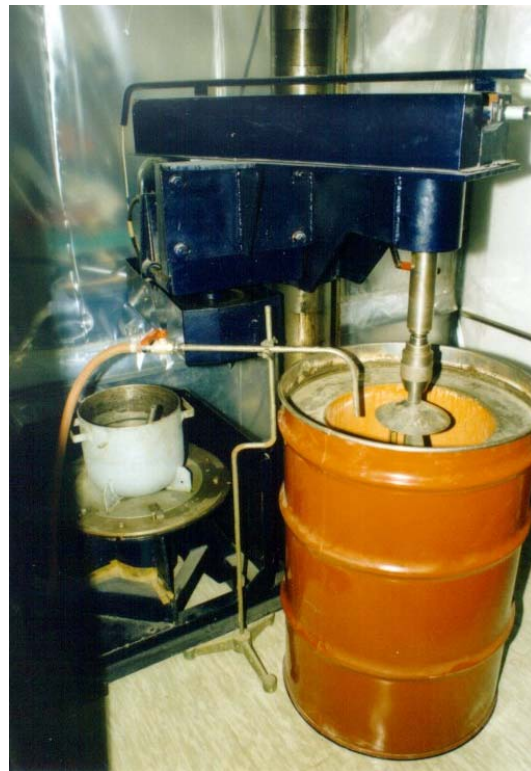
Fig. 2. Pilot mixer in the cask