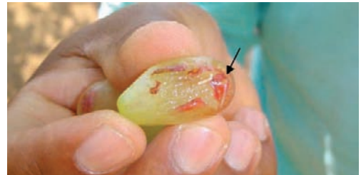
Figure 2. Christman rose grapes infested by larvae of Ceratitis capitata

flies must be characterized and their infestation threshold determined to efficiently monitor the insect and control its population growth.