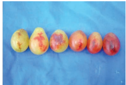
Figure 3. Grape cut, with the larva of Ceratitis capitata