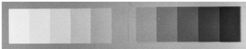
Figure 2. Attenuation gradient used in the phantom development.