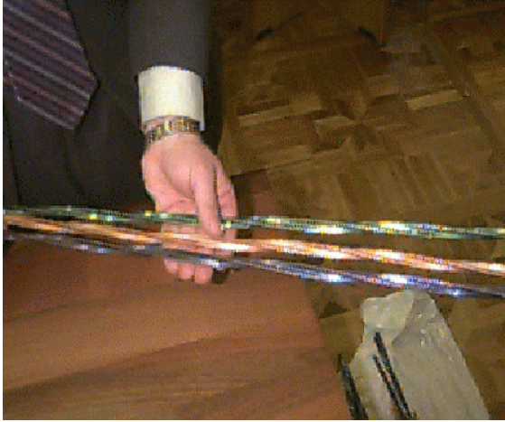
Sample “Seed” Rods for T-H Testing