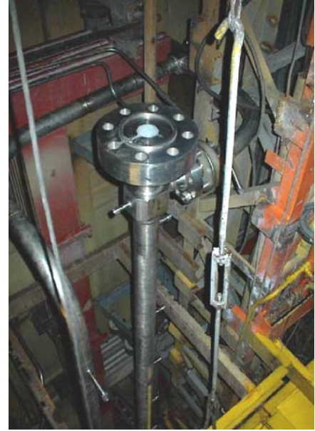
T-H Test Facility @ Kurchatov