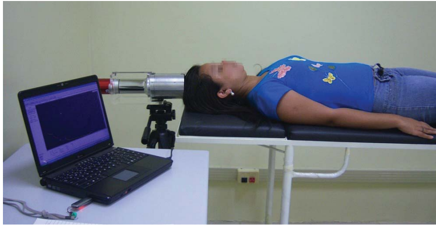
Figure 2. OEI positioning in relation to the detector.

150 measurements were performed in this geometry within 60 days of individual monitoring of internal exposure. In all measurements, seven accidental incorporations were found, resulting in the average incorporated activity of 38.3 MBq.