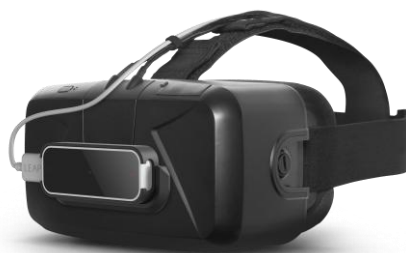
Figure 3: Oculus Rift[10].

Oculus Rift is a virtual reality equipment for electronic games. Basically, it's a visual system Head-mounted display type. It can also be consider an augmented reality glasses for those who like games, developed by Oculus VR [10]. It is a device that promises to take 3D applications to the next level. It projects three-dimensional images on an LCD screen with the assistance of the accelerometer and gyroscope recognizes the user's head movements. The virtual reality helmet, Fig. 3, is being explored in several other fields, such as: education, health, housing market and others.