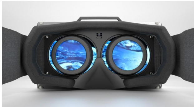
Figure 4: Stereoscopic view of the oculus rift [10].

Another point that drew attention was that when using the helmet, which displays a three-dimensional stereoscopic image (Fig. 4), there was no eyestrain or headaches, something that occurs frequently when watching TV or movies in 3D.