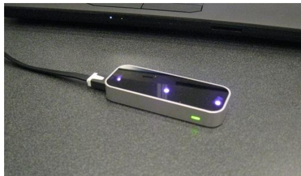
Figure 5: Leap Motion [9].

Leap Motion is a small device consisting of a sensor capable of capturing the ten fingers movements of the user, and may also be considered as an optical tracking system based on stereoscopic vision, Fig. 5. These device allows you to control objects in the virtual environment with your own hands, as if you were physically in the environment, giving sense of immersion. The device uses infrared cameras to capture accurate and simultaneous movements of the fingers within hundredths of a millimeter [9]. In addition, the latency is non-existent for human eyes, being lower than the refresh rate of computer monitors.