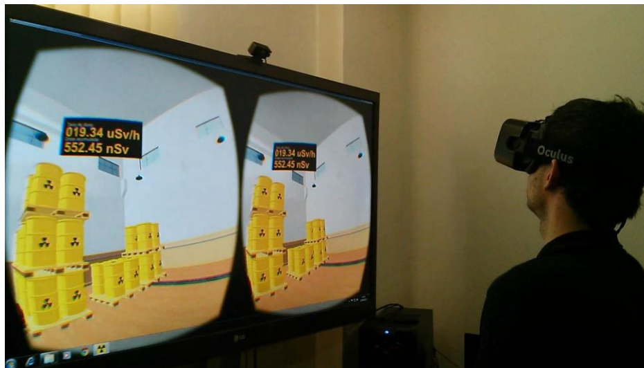
Figure 7: Stereoscopic view of the IEN.

Figures 7 and 8 presents the virtual environment developed. It is also possible to see how the Oculus Rift was used to give more realism and stereoscopic vision of the modeled environment. Finally, the Leap Motion was responsible for the movement of the avatar with the shifting of the user's hand.