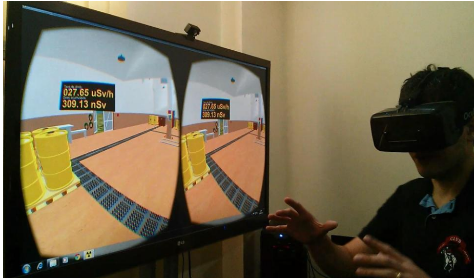
Figure 8: Oculus Rift View and Leap Motion Detecting Hands.