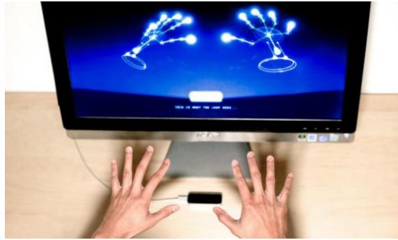
Figure 6: Leap Motion detecting the user's hands [9].

This equipment was used in the virtual environment to give more realism while moving the character. The sensor was added to the virtual environment to move the avatar in the scenario using only the user's hands instead of the traditional forms, such as: the mouse and the keyboard. By placing a hand in front of the sensor, this is detected, making the virtual character able to move. When the user performs a slight rotation in hand, the avatar is also rotated around its axis, in the virtual environment.